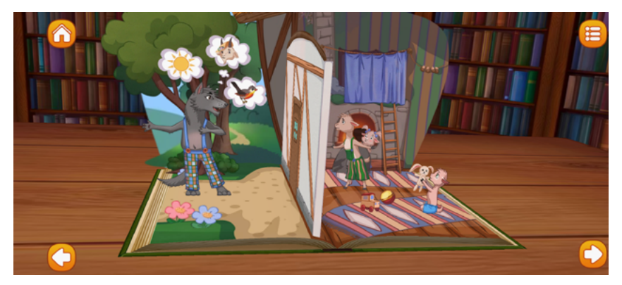
Fig. 2 | Screenshot from Fairy Tales .

From 2012 to 2015, Dublin-based company StoryToys launched several series of digital pop-up books between, spearheading the application of pop-up-book design to digital apps. Previously, browser games like Disney's Winnie the Pooh , developed by Disney Interactive and already released in 2008 with a Windows port released in 2011(?)<sup>4</sup>, proved the concept. Here, Winnie is guided by clicking on hotspots through the Hundred Acre Wood. As Winnie pursues his search for honey, each new scene is staged as one double-page spread of a pop-up book. Apps with a similar approach prove successful. For instance, the digital picture book app Fairy Tales – Children's Books (also Fairy Tales – Bedtime Stories ) by Tashkent-based Amaya Kids, which is also based on the aesthetics of pop-up books, has been downloaded over 1 million times in the Android store alone and has received above-average ratings from users ( Fig. 2 ).