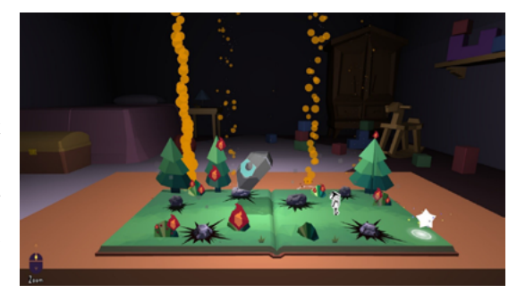
Fig. 9 | Screenshot from Bookend

Other games follow a similar design choice of using the popup pages as landscapes, with Tengami possibly being of some influence due to its wide critical reception. In Bookend (2019) by independent developer Paper Crown Interactive, a short action-puzzle game, players must steer a young witch through a sequence of pop-up book pages ( Fig. 9 ). The main character flees an angry mob that blames their mother, also a witch, for an asteroid threatening to destroy their village. On a game mechanics level, each self-contained double-page spread of the simulated book is a section or level of the game, and on a narrative