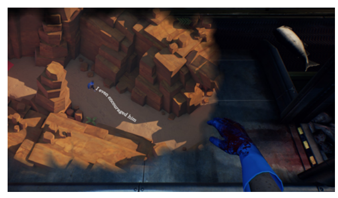
Fig. 13 | Screenshot from Edith Finch 3

and interface devices, performing the same gestures time and time again. It is here that lies the main similarity of movable toy books and digital games: in touching, pulling, turning of that make the toy seemingly — magically — come to life. And it is games like What Remains of Edith Finch as well as the aforementioned games like It takes two or The Inheritance of Crimson Manor that task us with thinking about this relationship.