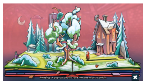
Fig. 10 Screenshot from Watch over Christmas.

Lastly, Dionous Games's 2021 adventure Watch Over Christmas should be mentioned. The work is a point-and-click adventure game faithful to genre conventions, which tells how twelve-year-old Cisco frees Santa Claus from Krampus' clutches on Christmas Eve in order to save Christmas. Near the end of the game, Cisco frees Santa Claus from the prison cell where Krampus holds them locked up. Cisco finds the key to