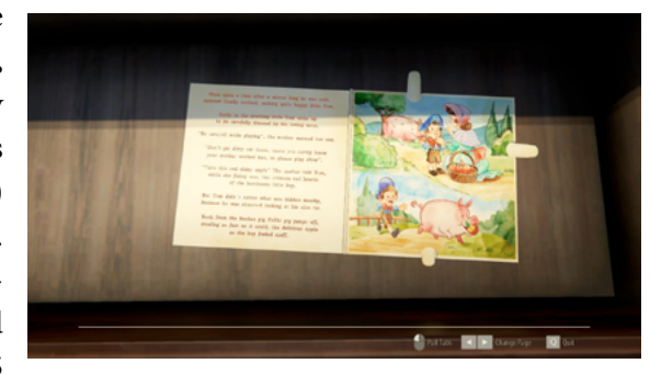
Screenshot from Crimson Manor 1.

One of the game's sequences takes Cody and May to Rose's playroom where they find two interactive books. The first is Fig. 6 | Screenshot from Crimson Manor 2.