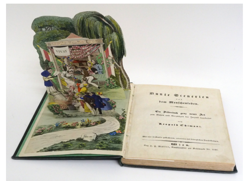
Fig. 3 | Screenshot from Chimani .

Throughout, the pop-up images in the app do not aim to be authentic representations of paper mechanics; rather, they attempt to use simpler means to achieve a comparable effect that echoes the aesthetics of pop-up books without incurring the technical expense of mechanical design and, subsequently, accurate digital replication of the mechanics. They stand in for the original paper mechanical components but replace them with simpler effects that can be achieved more quickly and cheaply.