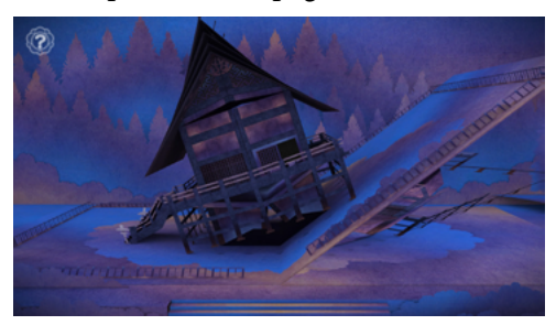
Fig. 8 || Screenshot from Tengami .

Nyamyam's Tengami (2014) uses a similar approach to the mechanical way players interface with the game. Inspired by the art of sumi-e, the platform adventure game set in a Japanese landscape sends players on a chase for cherry blossoms in an effort to revive a dead cherry tree. Quite unlike the aforementioned games, however, the spaces players navigate in Tengami presented as the pages of a pop-up book<sup>8</sup>. This book, which lies on a table in the background of the menu screen, opens and is zoomed in on at the outset of the game in an introductory sequence, letting players know that the story they are about to experience takes place on the pages of this book. The pages themselves, then, function and look much like a theatre stage.