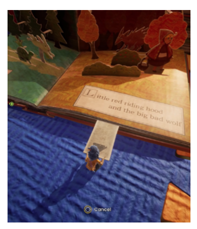
Fig. 7 | Screenshot from It takes two 2

a sound book that at the touch of a button replays four different sounds (pig, alarm clock, ambulance, rooster). The second is a pull-tab-pop-up book that shows the fable The Tortoise and the Hare as well as Little Red Riding Hood ( Fig. 7). Players can interact with both books, pulling tabs or pressing buttons as they please, to set the characters in motion or make the sounds play. Much like Nöth has pointed out, in It takes two "messages of the media are about messages of the media" (Nöth 2007, 3). By remediating many different games and toys, It takes two mimics party video games such as Party Mix (1983), the Mario Party series (since 1998), or Wii Party (2010). Moreover, the game establishes itself by the by as an archive of interactive artefacts that sit in a cross-section of media history and toy history. Presenting different types of games and ludic devices, It takes two forms what appears to be a history of modern interactive media and toys and places within this space the two interactive books, presenting them as part of the history, social, and media context of digital games such as itself.