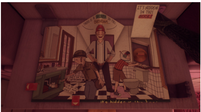
Fig. 12 Screenshot from Edith Finch 2 .

In several ways, this interactive book appears as a mise-en-abyme of the game. For one, the book shows the bathroom within the bathroom and sits in the exact spot where the secret passage that it speaks about is hidden. Secondly, like the digital game, the remediated book creates a representation of a (fictional) three-dimensional space by means of arranging two-dimensional elements: here (simulated) cardboard, there pixel graphics. Moreover, the gesture performed by the players to open the passage — pulling the