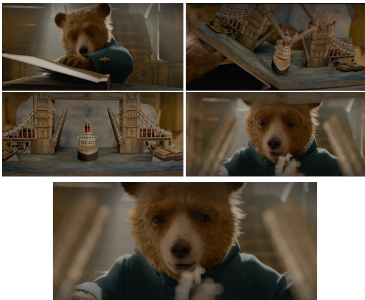
Fig. 2 || Paddington unfolds Kozlova’s pop-up book of London (King 2017, pt. 10:07-29).

the foreground scenery of the popup book is also shifted out-of-focus, to draw attention to the subject in between – Paddington. Whilst hazy, the pop-up spread is identifiable as a popup of London Bridge, which frames Paddington’s face as his expression changes from one of wonder, to a sad wistfulness as he comments, “Aunt Lucy always dreamed of coming to London and never had the chance” (Fig. 2). The camera is so close to the pop-up book that the viewer is essentially placed inside the diorama and can feel the full effect of Paddington’s subtle shift in emotions as he reacts to the doublespread.