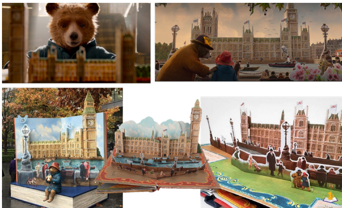
Fig. 9 | A remediation chain – paper, paint, pixels, paint-and-metal, paper – [Top Left] The CGI pop-up book (King 2017); [Top Right] the animated bookscape (King 2017, 2); [Bottom Left] The pop-up sculpture (3D Eye 2024); [Bottom Middle] The pop-up prop (Propstore Auction 2023); [Bottom Right] The pop-up Collectors' Edition (Finch 2017).

Finch's book ends with Paddington and Lucy magically transported from 'inside' the book to the doorstep of 32 Windsor Gardens – although, ironically, this transportation is depicted by a central pop-up of the pair still in the physical book held in the reader's hands, with a meta-fictional illustration of Kozlova's book of 'London' tucked under Paddington's arm. By remediating Kozlova's book of 'London' inside a pop-up book adaptation of the movie within which it exists, Finch's text captures the paradoxical dance of being both imaginatively 'within' and physically 'outside of' media in an age of convergence.