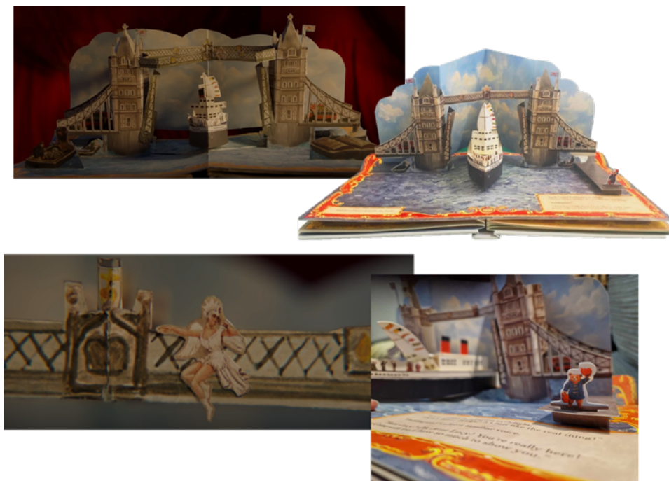
Fig. 8 | A CGI antique to a paper-and-ink hypermediation – [Top Row] Movie diorama (King 2017), Finch's remediation (Finch 2017, 5–6); [Bottom Row] paper Kozlova in the movie (King 2017), paper Paddington in Finch's remediation (Finch 2017, 6).

entered online for a chance to win a real-life prize: a copy of the Collectors' Edition Paddington Pop-Up London (Finch 2017) book, published by Harper Collins (The Big Issue 2017). Anybody who visited Paddington's Pop-Up London art trail may well have been treated to an extra dose of nostalgia when their own personal memories of experiencing the Paddington's Pop-Up London art trail appear to be hypermediated in both Paddington and Buchanan's meta-scriptive uses of Kozlova's book. The art trail competition prize, the Paddington Pop-Up London book, is the final link in a long chain of pop-up remediations, from Hawcock's paper prop, to the digitally-rendered 3D-animated model, to the whirling bookscape sequence, to the painted, interactive metal-and-plastic sculptures, before finally returning to the paper-and-ink dimensions of the book – although the consumer may well experience these remediations in a different order (Fig. 8).