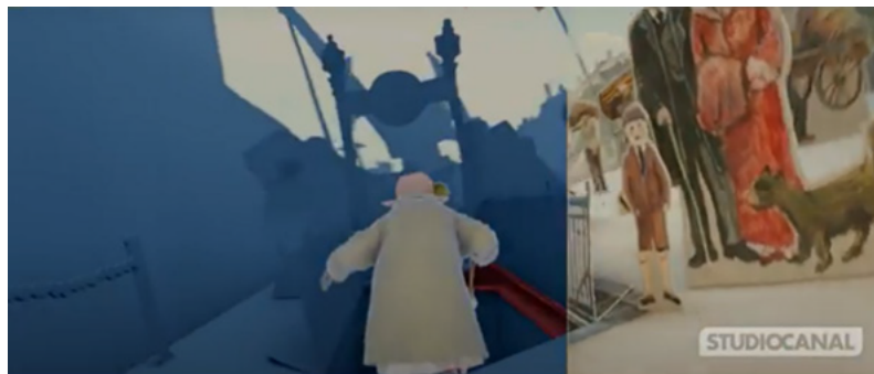
Fig. 4 || NUKE-projection (Framestore 2018).

In 1992, Paul Johnson observed how “the concept of the book as a 3D, architectural experience for children has a surprisingly long history”, from “pop-up engineered toy theatres of the nineteenth century, to the sophisticated 180-degree pop-up inventions of the twentieth century” (P. Johnson 1992, 140). It is perhaps unsurprising then that across various media forms – such as cinema, advertising, music videos, toys, and theatre – the pop-up book has been remediated as a maximized book-landscape or ‘bookscape’, to be traversed by miniaturized characters. My understanding and use of the term ‘bookscape’ is influenced by Willem de Bruijn’s article “Booksapes: Towards a Conceptualisation of the Architectural Book” (de Bruijn 2006). In the article, de Bruijn suggests that “the kind of readerly drift that the book provokes is not unlike the way in which a stroller wanders through a pleasure garden, collecting fragments of knowledge at every turn of the page” ( Ibidem ) – reading echoes the act of navigating space. De Bruijn uses