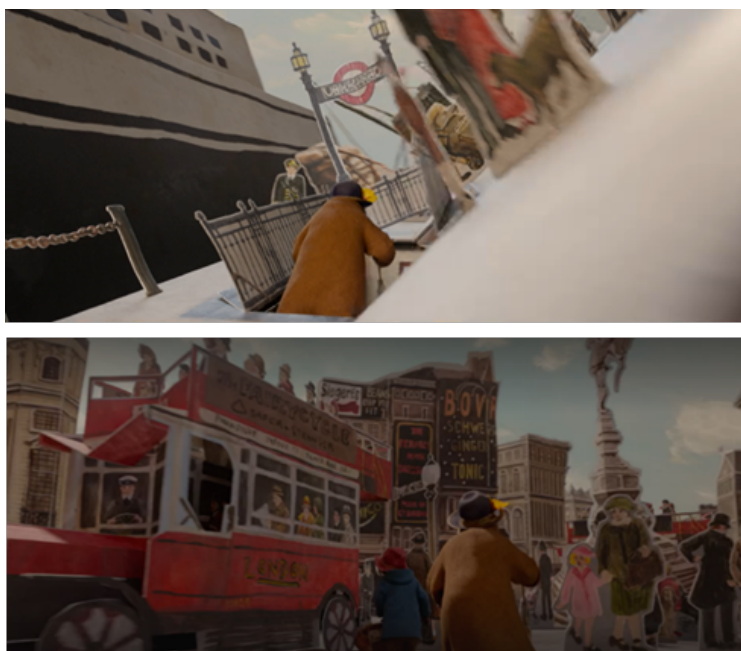
Fig. 3 || A quick tube ride between the pages (King 2017, pt. 9:30-35).

Static, paper-doll elements, who are easy to weave through and universally polite, populate a perfectly painted, clean, and tidy 1940s bookscape-cityscape. At one point, Paddington and his hundred-year-old Aunt Lucy enter a pop-up tube entrance on the South Bank of the Thames and disappear down a paper-cut hole into the 'book base', emerging, after a skeuomorphic page-turn animation, in a pop-up Piccadilly Circus (Fig. 3). This fantasy tube trip (which, it is presumed, coincides with Paddington's physical turning between pop-up dioramas in the 'real world' of Mr Gruber's shop), replaces the inconvenience of the London Underground (mobility issues for a pensioner and child, the fee, the crowds, the time spent travelling), with a swift and safe journey, romanticising a travel system that allows tourists to hop freely and easily from place to place. Expanding Tribunella's observation that the flaneur is often aligned with the figure of the Romantic child, Olga Bukhina observes how "characters of picture books have much more freedom of movement around the city than their readers/peers", and notes how this "spirit of 'flaneurism' in picture books" thus "promises enormous walking and transportation possibilities that are so appealing for a real child" (Bukhina 2019, 236). In Paddington's imagination, the additional, tangible and movable paper-engineered elements of the book indulge and facilitate a vivid fantasy of free movement.