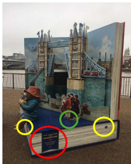
Fig. 7 | The Tower Bridge sculpture on 'Paddington's Pop-Up London' – [Red Circle] bookmark sign; [Green Circle] red push-buttons; [Yellow Circles] hidden speakers (circles added, 3D Eye, 2024).