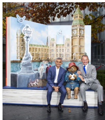
Fig. 6 | The Mayor of London Sadiq Khan and Paddington 2 actor Hugh Bonneville pose with Paddington's Pop-Up for a promotional photograph (D. Field 2018).

The visitor is encouraged to be an active flaneur, following the pop-up book trail to stroll through the city and peruse real 'sights' of London represented in the pop-up book, just as Paddington imagines during his bookscape fantasy. Further, at each stop, the visitor can also find and collect letters hidden in the sculptures to spell out a mystery word 'LONDON'. This search-and-find activity is effectively a parodic remediation of how the villain of Paddington 2 , the egotistical thief Phoenix Buchanan, uses the pop-up book of London to seek out Kozlova's hidden fortune. In the film, a small paper figure of Kozlova points to particular spots in the five London landmark dioramas that, when visited in the 'real world' of London, reward the treasure-hunter with secret letters which, when combined, dictate a series of musical notes that, when played on a specific fairground organ, deliver her valuable jewellery. Whilst those who completed the sculpture trail did not receive jewels, the hidden word could then be