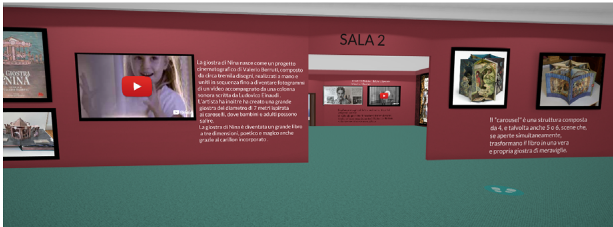
Fig. 3. || Exhibition room of the virtual exhibition Oltre le pagine , created using the Artsteps platform.

to the need to make the spatial and performative nature of pop-up books perceptible. While the bibliographic record allows the object to be described and its features documented, the digital exhibition space enables it to be placed within a narrative path, fostering a form of engagement closer to the museum visit experience ( Fig. 3 ).